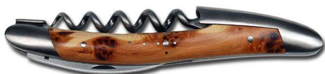
Ref: SOM GE (juniper)