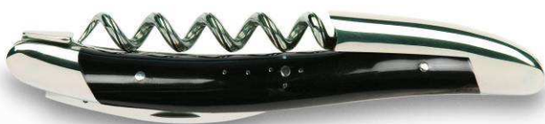
Ref: SOM BN (black horn)