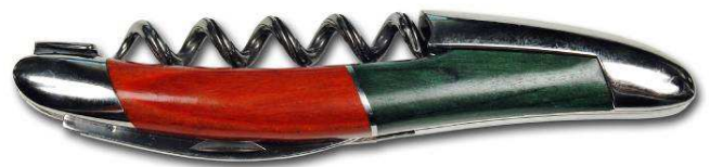
Ref: SOM ST CO/VE (green and cocobola)