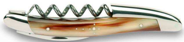
Ref: SOM B (marbled horn)