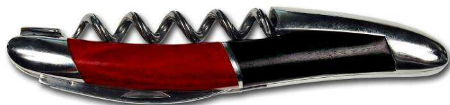
Ref: SOM ST RO/BLA (black and red)