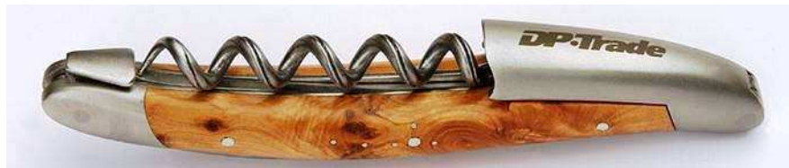
Laser engraving of the booth