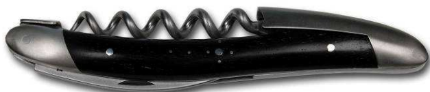
Ref: SOM EB (ebony)