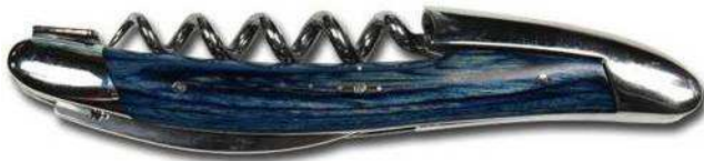
Ref: SOM ST BLE (blue)