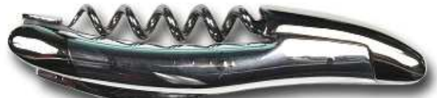
Ref: SOM ALU (aluminum)