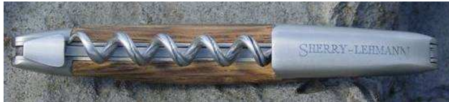
Diamond engraving of the booth (name or simple logo)

Name, logo... each piece can be customized on request.