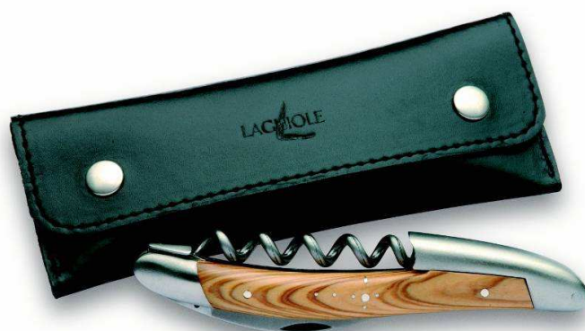
Ref: SOM OL (olivewood)

Introduced later, precious and exotic woods present a beautiful variety of textures. All these models are completed with a black leather case and available with matt or shiny finish.