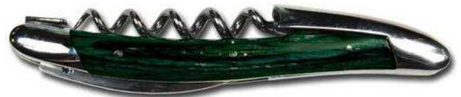
Ref: SOM ST VE (green)