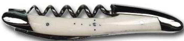
Ref: SOM OS (bone)