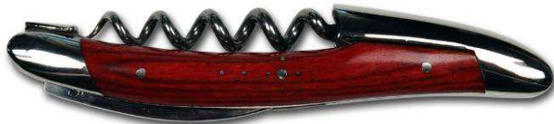
Ref: SOM ST RW (rosewood)