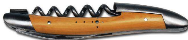
Ref: SOM BU (boxwood)