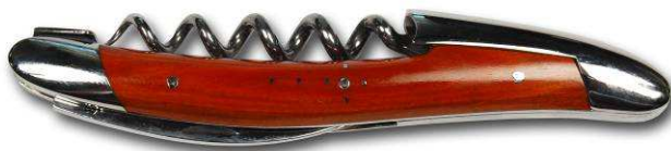
Ref: SOM ST CO (cocobola)