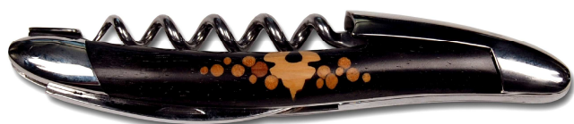
Ref: SOM MA EB (marquetry - ebony)