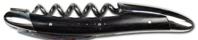
Ref: SOM ST BLA (black)

Staminawood is a white wood injected with tinted epoxy. This material is highly resistant and presents a beautiful variety of colors.