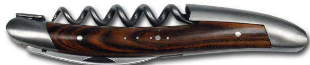
Ref: SOM PI (pistachio)