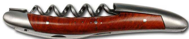
Ref: SOM BR (briar)