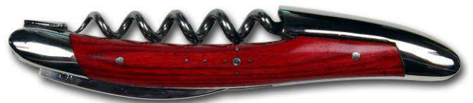
Ref: SOM ST RO (red)