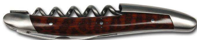
Ref: SOM AM (snakewood)