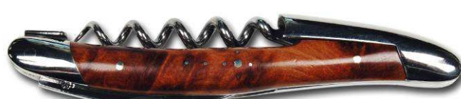
Ref: SOM TH BRI (thuya)